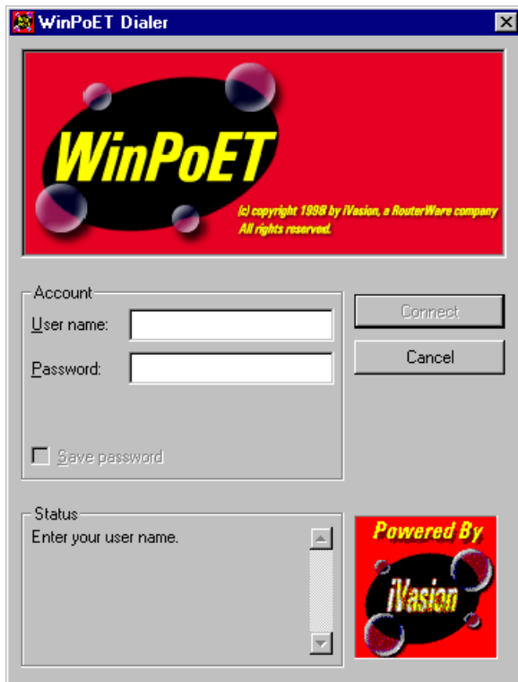
WinPoET Dialer dialog box